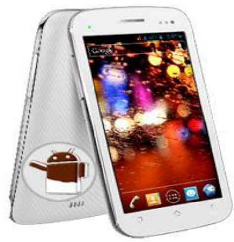
Fig.3 Micromax A110 Super phone Canvas 2

Micromax A110 Super phone Canvas 2: At a glance it has 5" Multi-Touch LCD Screen, Android OS 4.0 ICS, 1 GHz dual-core processor, 8MP Auto-focus LED, Flash camera, Dual SIM, 2000 mAh battery as shown below in fig.3