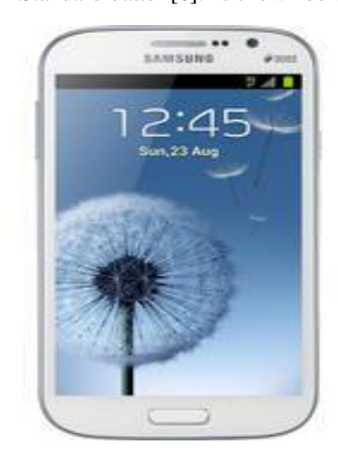
Fig.2 Samsung Galaxy Grand Duos i9082

Bean 1.2 GHz Dual Core Processor,5 inch WVGA TFT LCD Screen,8MP Camera, 8GB of internal storage,2100 mAh Li-Ion Standard batter [6]. As shown below in fig.2